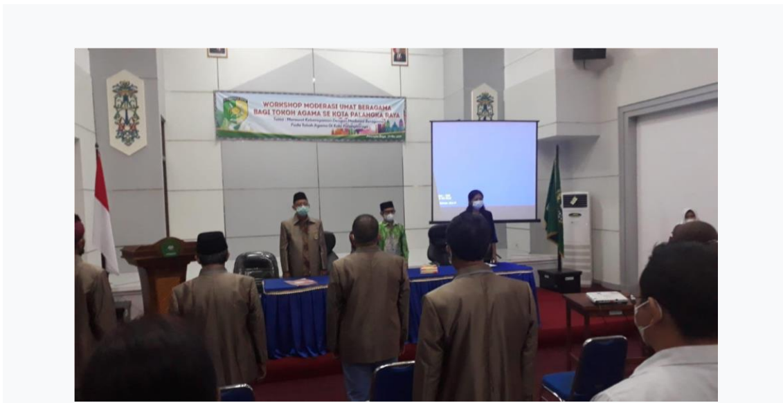
Figure 2: Workshop on Religious Moderation FKUB Palangka Raya

The harmony of religious life in Palangka Raya City is due to the community's pluralist religious attitude and the support from the government. The Palangka Raya City Government through the Ministry of Religion (Kemenag) of Palangka Raya City and the City of Religious Harmony Institutions (FKUB) consistently conduct socialization about religious moderation through seminars and workshops as shown in Figure 2 below: