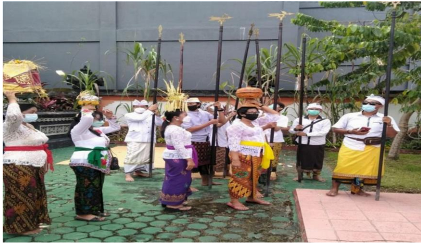
Image : Hindu social interaction in rituals at Pitamaha Temple in Palangka Raya (Rahmawati document, 2020)

In addition to the above interactions, Hindus also carry out social interactions at events that are carried out independently by each of them, including the implementation of wedding rituals, mourning, and gatherings during celebrations of religious holidays such as the celebration of Nyepi.