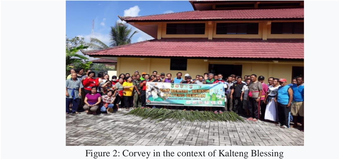
Figure 2: Corvey in the context of Kalteng Blessing

activity, namely by doing corveys alternately in each environment of the house of worship. As picture 2 below: