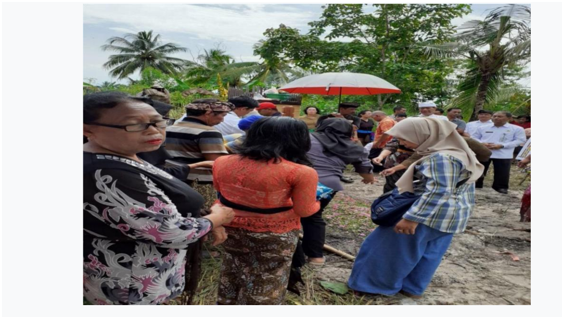
Figure 3: Social Interaction of Hindus with Other Religions

In addition, the social interaction of Hindus in the midst of other religious communities is also carried out individually such as gathering at the time of celebration of religious holidays, actively participating in helping other people in various activities such as weddings, mourning and others carried out by other religious people as shown in Figure 3 below :