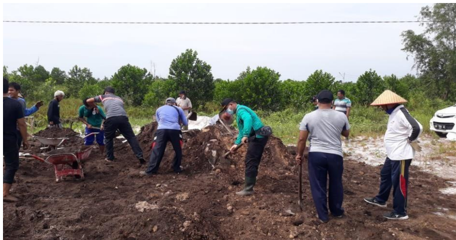
Image : Mutual cooperation of Hindus at Praja Pati Temple, Palangka Raya City

As social beings, Hindus in Palangka Raya City also carry out various social interactions among Hindus themselves. The social interactions carried out by Hindus in the city of Palangka Raya include cooperation, the implementation of rituals, the performance of education. Gotong royong in Hindu terms referred to as ngayah is a routine activity carried out by Hindus in Palangka Raya City on Sundays, especially by gentlemen. This activity was coordinated directly by the Head of Suka Duka to carry out cleaning in the temple area as shown below: