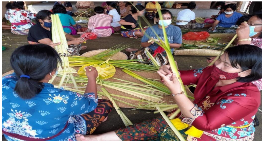
Image : Hindu social interaction in preparing rituals at the Sali Paseban Batu Tangkiling Temple (Rahmawati document, 2020)

the ritual to the end of the implementation. As preparation for the rituals of Hindus in Palangka Raya City, both men and women with their own awareness come to the temple to jointly prepare ritual facilities and infrastructure. Organization Suka Duka also coordinates this activity. One example is shown in the image below: